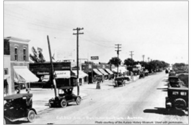
The corner of Dallas Street and Colfax Avenue was very different in

The Northwest Aurora Neighborhood Organization is a vital contributor to our community, responsible for many worthwhile projects affecting the quality of life in Original Aurora. NANO is Aurora's oldest neighborhood organization, founded May 1976.